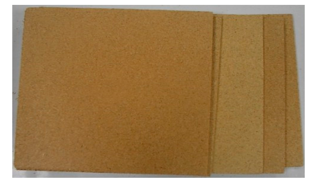
Figure 1. Type A giant reed boards manufactured.