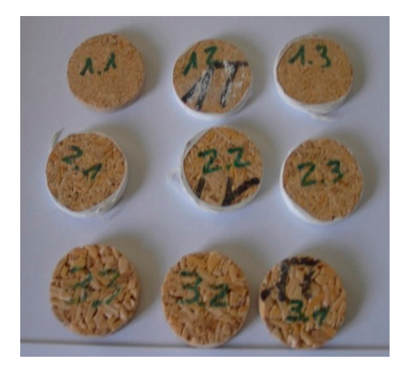
Figure 2. Particles and acoustic test samples.