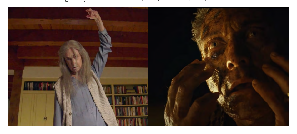
Figure 4. Frames from M. Night Shyamalan's The Visit (2015) and Old (2021).

Undoubtedly, there is a sociological component that is bringing to the surface, in any artistic expression —literature, comics, videogames or cinema—a tendency to show reality, credible and stark, in fiction, and accentuated, in contrast, by the extreme exposure and pressure we face through the Internet and Social Media concerning physical appearance and the intrinsically human desire to stay young.