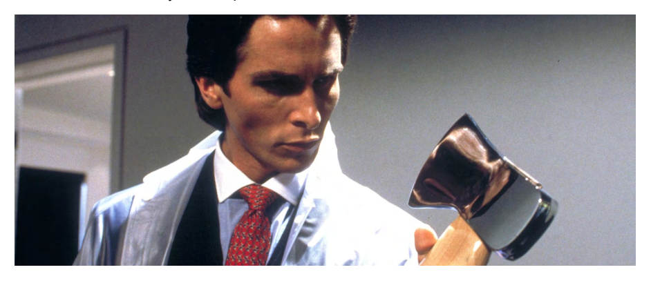
Figure 3. Frame from American Psycho (Mary Harron, 2000).