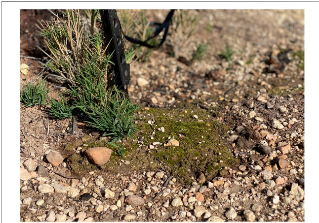
FIGURE 1 | Patch of moss biocrust emerged after a wildfire stabilizing soils surrounded by bare soils exhibiting erosion symptoms.

stressful conditions for vascular plants, e.g., soil compaction provided by heavy machinery in post-fire management, might create conditions that support long-term persistence of biocrust in those environments (Gall et al., 2022a).