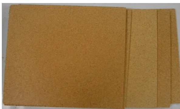
Figure 1. Type A giant reed boards manufactured.