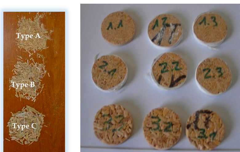
Figure 2. Particles and acoustic test samples.

The method followed to determine the sound absorption coefficient of a material under normal incidence is based on the acoustic impedance tube. This test method uses an impedance tube, two microphone positions and a digital signal processing system [56]. This technique requires a correction procedure prior to testing to minimise differences in amplitude and phase characteristics between the two microphones. The Acupro Spectronics impedance tube (Spectronics C., Lexington, KY, USA) was used for testing, with a frequency range between 50 and 6300 Hz. Three samples of each type of board were used for the acoustic tests. The different samples can be seen in Figure 2.