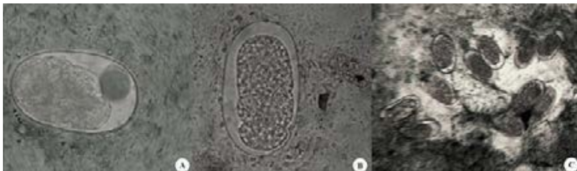
Figure 1. Hookworm egg in Kato-Katz technique (x400) (A); Hookworm-like egg in Kato-Katz slide (x400) (B), Hookworm-like eggs in Kato-Katz slide (x100) (C).

In the 497 faecal samples analyzed by Kato-Katz, in 159 samples (32%; IC95%: 0.2-0.3) we found the presence of eggs that were similar to those of hookworm (Figure 1A), named as hookworm-like eggs (Figure 1B and 1C). A total of 82 (51.1%; IC95%: 43.5-59.5) were from males and 77 (48.4%; IC95%: 40.4-56.4) were from females, mostly belonging to children who aged 9 years old (16.4%; IC95%: 10.9-23.0).