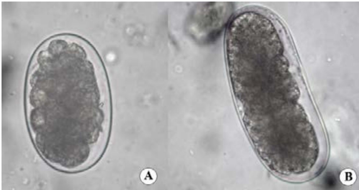
Figure 2. Hookworm egg (Diphasic concentration technique x 400) (A); Hookworm-like egg (Diphasic concentration technique x 400) (B).

In the remaining 157 samples (98.7%; IC95%: 95.5-99.8), hookworm-like eggs with a slightly concave side and with range of size of 85.0 to 92.5 \mu\text{m} x 35.0 to 40.0