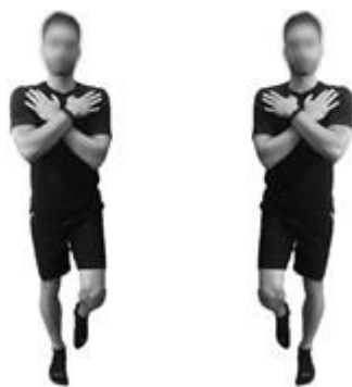
Figure 1. One-leg test position.

The participants performed a one-leg balance test. This test was chosen for two reasons: (1) so that both the BMX athletes and the control group can execute it; (2) to check if a general balance test can provide useful information, facilitating its use in field tests. Each participant performed four trials in a laboratory setting, two trials with the dominant leg and the other two with the non-dominant one. Then, the best trial of each leg was selected, considering this one the trials with lower bivariate variable error. This minimized the effect of fatigue and learning and ensured that the results reflected actual performance on the task. Leg order was counterbalanced between participants. Each trial lasted 40 s with a 30 s recovery time. Participants were instructed to stand as upright as possible to avoid displacement of their COP. Figure 1 shows the position adopted by the participants during the task: barefoot, the leg that was not on the ground was placed close to the other above the ankle, arms crossed on the chest, eyes open, and looking straight ahead [29]. If these conditions were not met, the trial was considered not valid and had to be repeated.