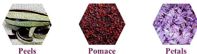
Figure 1. Sources of anthocyanin-rich wastes.

myrtillus ), cranberry ( Vaccinium macrocarpon ), fig ( Ficus carica L.), grapes ( Vitis sp.), grumixama ( Eugenia brasiliensis ), juçara ( Euterpe edulis Mart.), purple corn ( Zea mays ), and petals of saffron ( Crocus sativus ) (Figure 1).